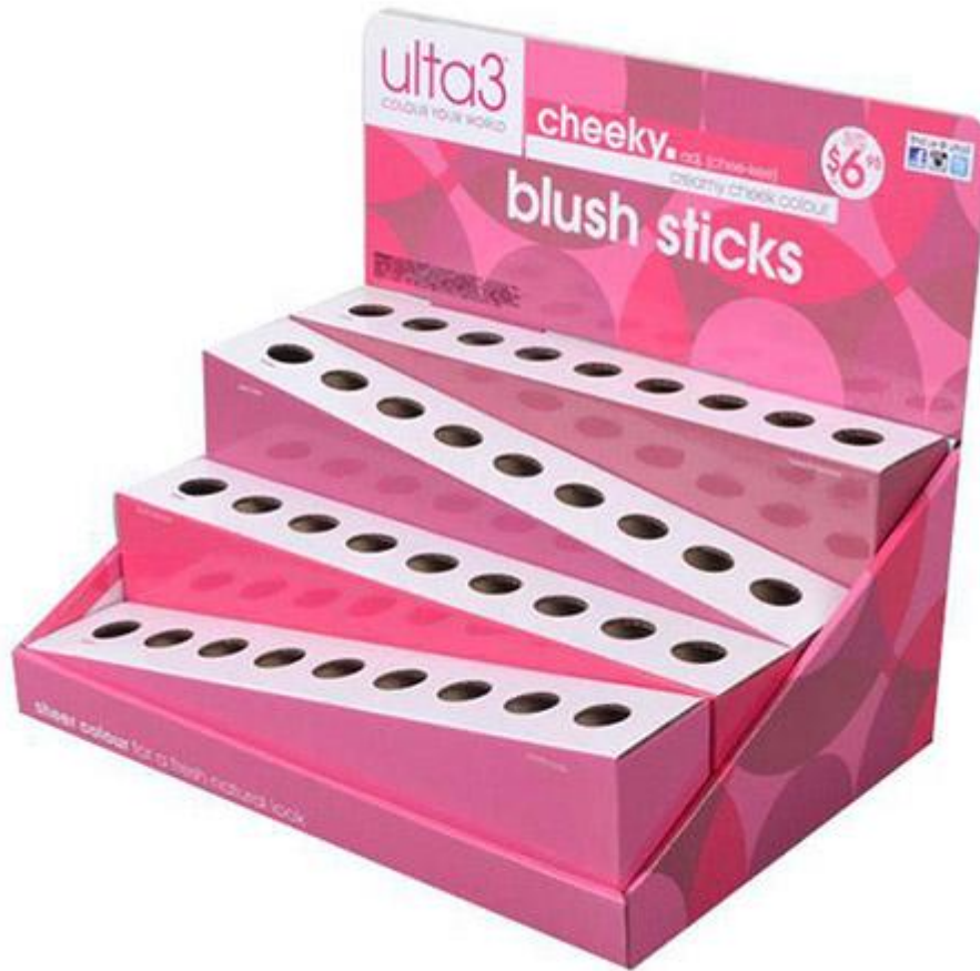
Sinst Cardboard Colorful Counter Top Display Box for Makeup Process