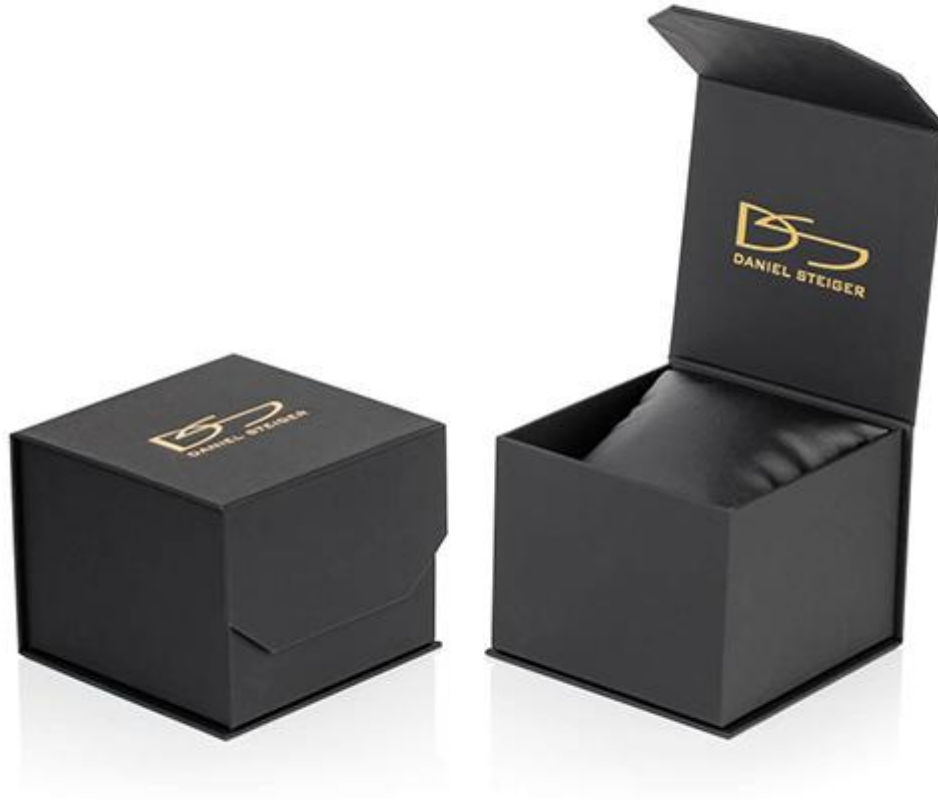
Sinst Cardboard Printed Gift Box for Smart Watch Process