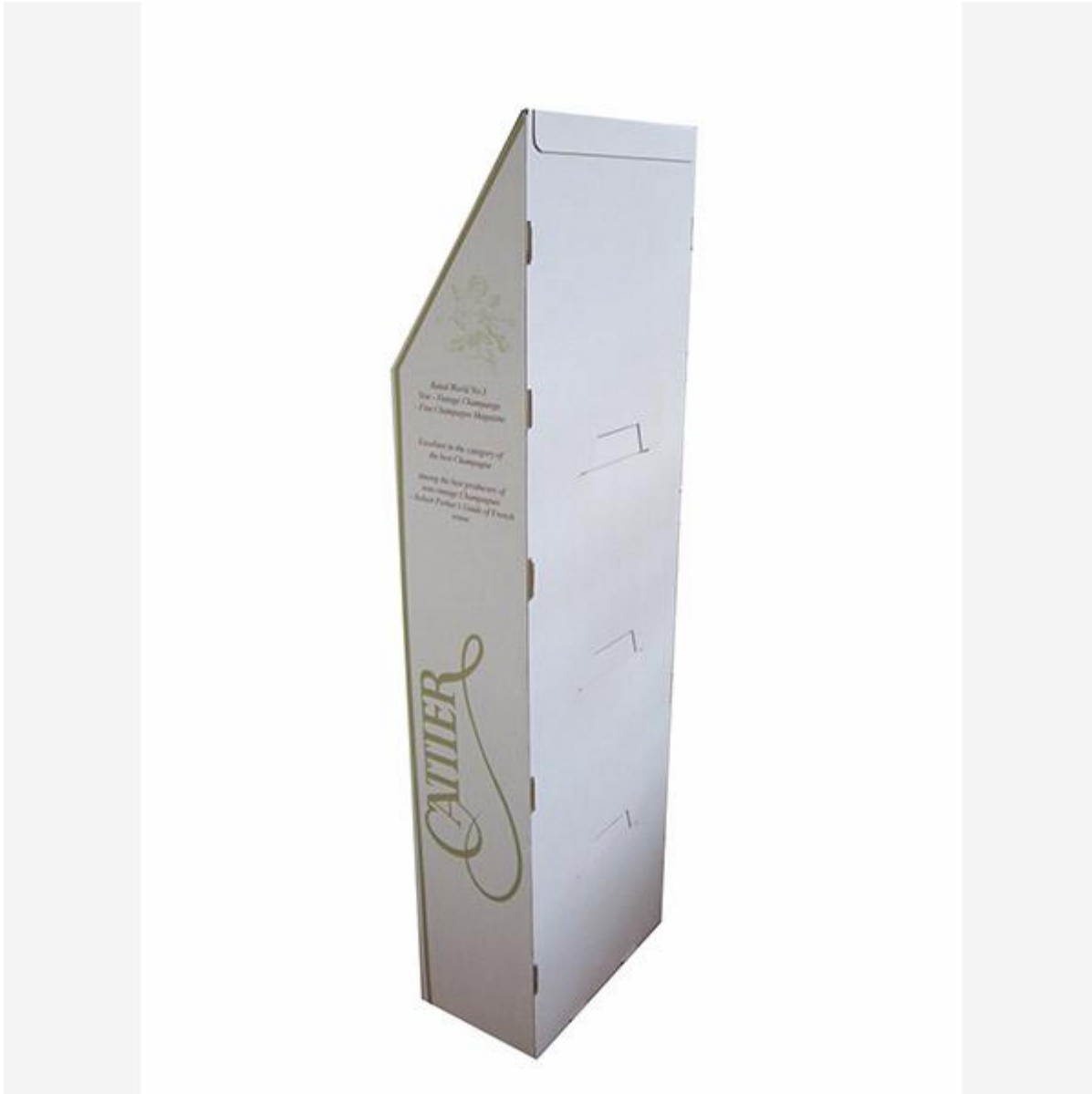
Sinst Cardboard Magazine Display Stand for Newspaper Process